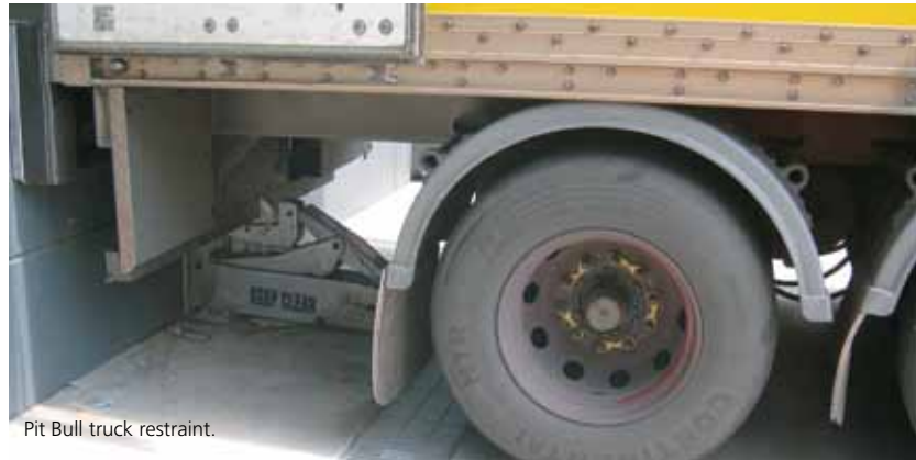
Pit Bull truck restraint.

Tieman is one of the largest suppliers of dock levellers and associated dock products in Australia. Its vast range of dock levellers, scissor and freight hoists, truck restraints and dock safety accessories are designed to assist customers in addressing Occupational Health and Safety concerns; and are designed to continue performing even in the harshest operating conditions.