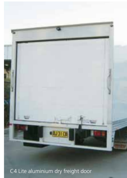
C4 Lite aluminium dry freight door

Its integrated extruded aluminium panel and hinge configuration has been