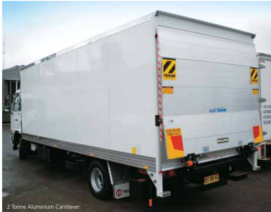
2 Tonne Aluminium Cantilever

HAVING IMPLEMENTED TIEMAN TAIL LIFTS ACROSS ITS ENTIRE TRUCK FLEET, BUDGET CAR AND TRUCK RENTAL IN BLACKTOWN, NSW, DIDN'T HESITATE TO PURCHASE ITS FIRST WHITING BY TIEMAN ROLLER SHUTTER TRUCK DOOR, FOLLOWING A CUSTOMER REQUEST.