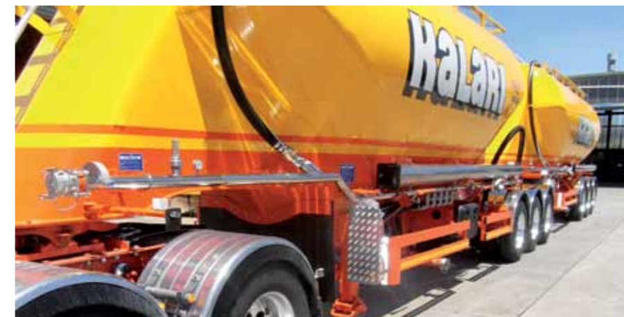
Polished s/s airlines & side under run protection.

The partnership between the tanker manufacturers has enabled Tieman to provide its customers with a European high quality aluminium tanker that has been engineered for Australian and New Zealand roads.