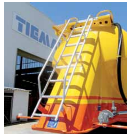
Ladder with safety side grab rails

combinations was displayed at the 2010 International Truck, Trailer and Equipment Show. Tieman began offering a dry bulk tanker product to its customers after teaming up with O.M.E.P.S, a leading Italian dry bulk tanker manufacturer, in late 2008.