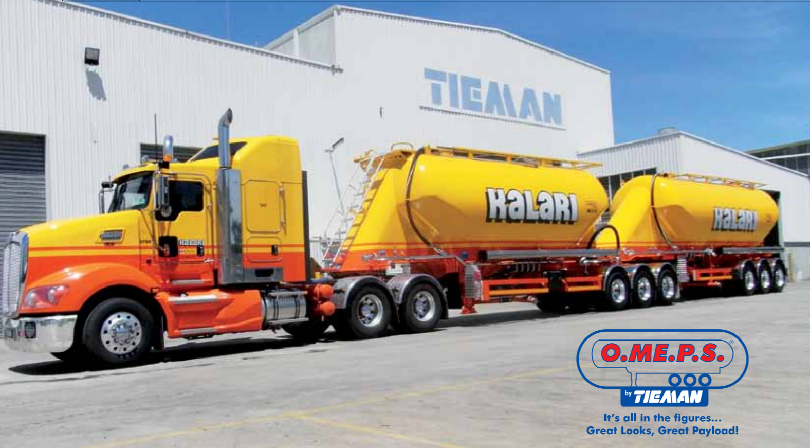
64 cubic metre bottom discharge aluminium 25m B-double.