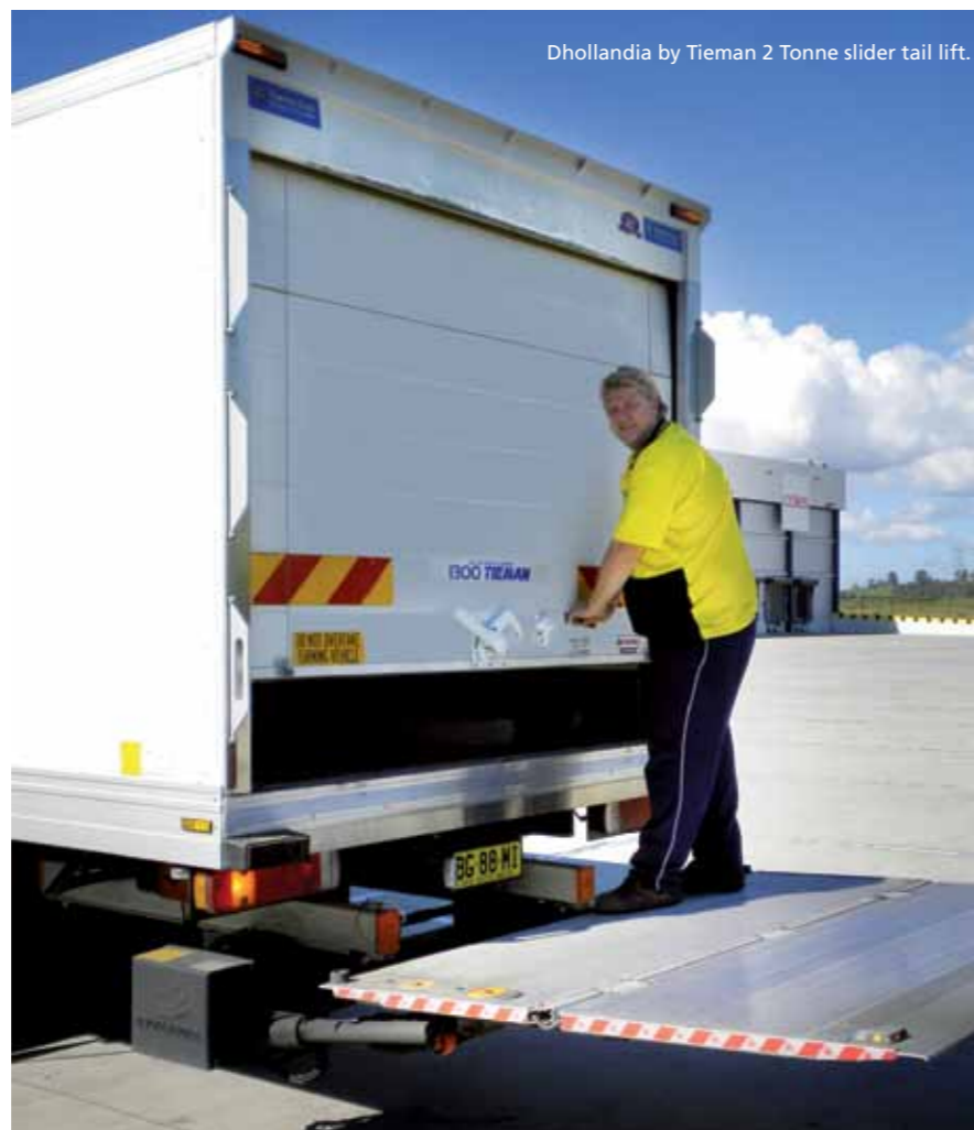
Dhollandia by Tieman 2 Tonne slider tail lift.

Maximum durability is achieved by finishing the frame and lift arms in polyester powder coating, and using zinc plated and chromed pins. Greasable low maintenance bushes fitted to all pivot points, coupled with